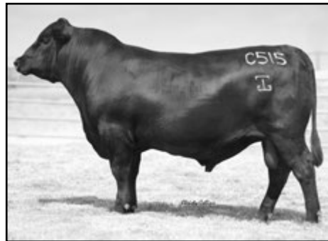
GAR Retail Product C515—Power, Performance, Prepotency, 2536. This is a Stock Bull!