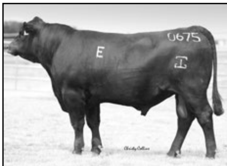
GAR Solution E0675—Solution is one of the greatest sires in the history of GAR! E0675 could be one of his best sons ever!