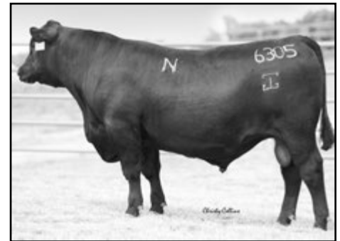
GAR Predestined N6305 is one of my absolute favorites, realizing that the "N" bulls are a bit younger he still made his way to lot 2. This bull is an awesome prospect for virtually all traits of economic importance. Lot 2 is the #1 %IMF bull in this sale.