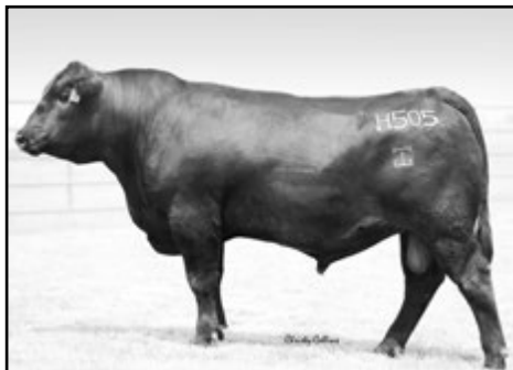
GAR Retail Product H505—Retail Product out of Prime Design's sister. He has one of the highest %IMF ratios in this sale. Top 1% rankings for %IMF, $G, and $B.