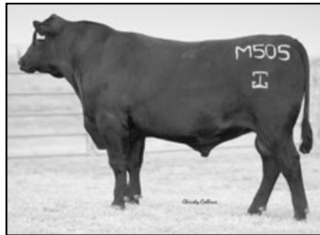
GAR Predestined M505 has quite simply tabulated one of the best non-parent genetic predictions in our history. His $Beef is the absolute highest $B index in this sale!