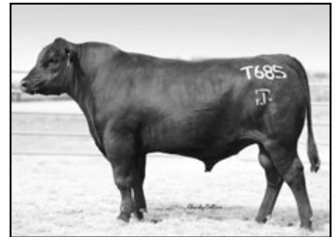
GAR Retail Product T685 should be adept at adding value across the board, check out 1391's % IMF record—no surprise that he has a +.81 %IMF EPD.

Since 1999, GAR customers using our USPB delivery rights have received over $2,012,223 in premiums and dividends. If you retain ownership, that's valuable marketing information!