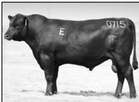
GAR Solution E0715 has the 2nd highest %IMF EPD in this sale. If you would like to make dramatic change in quality grade this bull can help! Pure calving ease excellence with marbling and growth.